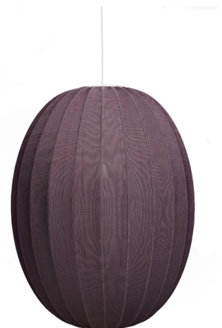
Burgundy High Ø65cm

The knitted outer mesh comes in a selection of 4 styles (Silver, Burgundy, Heather Green and Light Pink), made of 2 coloured threads giving the special character to the lamp.